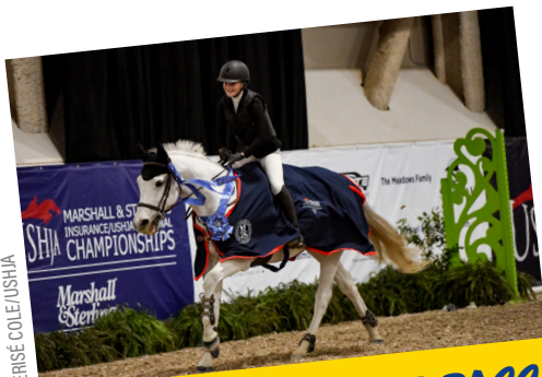
GOLDEN BACKSTAGE PASS